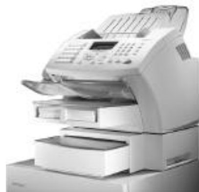
Optional 500 Sheet Paper Cassette