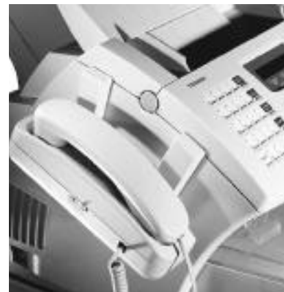
Optional Telephone Handset